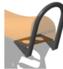
Front grab handle